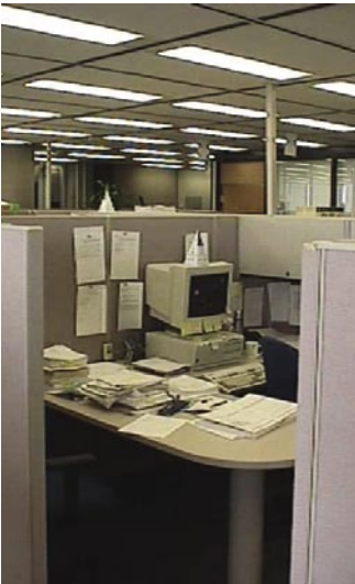
A productive work setting?

Therefore, the effects of changes in the design of an organization's office space on their bottom line are complex. Employers are increasingly aware of this complexity, and are increasingly willing to value environmental satisfaction as well as simple real estate performance indicators.