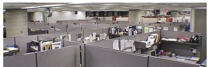
A typical open-plan office.