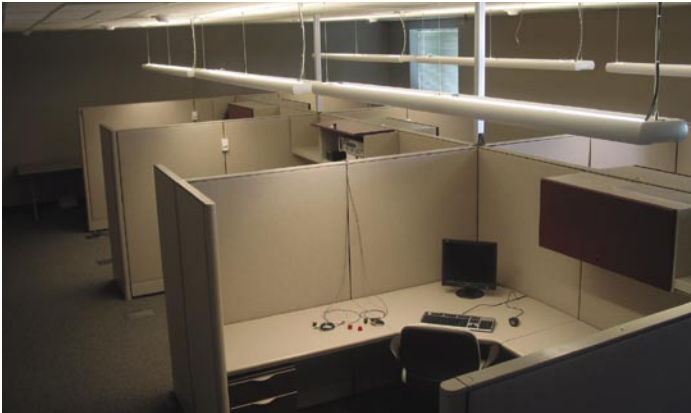
A full-scale office laboratory for human factors study at the Institute for Research in Construction, National Research Council Canada.(NRC/IRC).