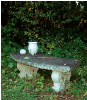
Sitting bench at Cortesia's Healing Sanctuary in Oregon.