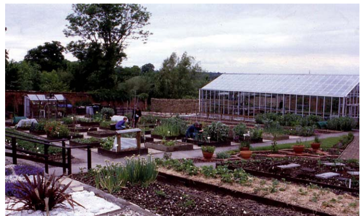
Therapeutic landscape designed for people with vision loss, outside London, England.

“Healing gardens” is a term frequently applied to gardens designed to promote recovery from illness. “Healing,” within the context of healthcare, is a broad term, not necessarily referring to the cure from a given illness. Rather, healing is seen as an improvement in overall well-being that incorporates the spiritual as well as the physical.