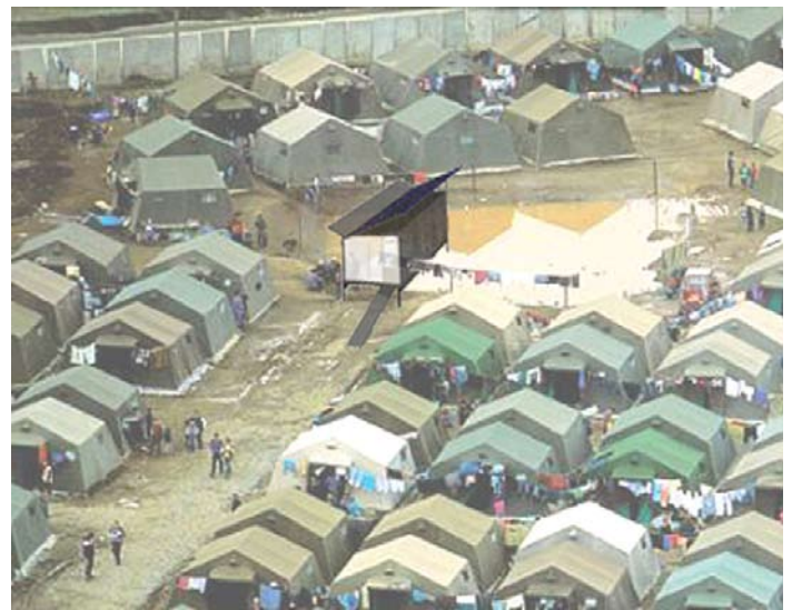
The Clean Hub could provide access to electricity, potable water, and sanitation in slums or temporary settlements.

few decades ago, the result of ever-warmer tropical seas. And with rapidly increasing populations living in vulnerable areas, we could see a whole new category of the homeless, “environmental refugees,” as Oxford scientist Norman Myers calls them, with “as many as 200 million people overtaken by disruptions of monsoon systems and other rainfall regimes, by droughts of unprecedented severity and duration, and by sea-level rise and coastal flooding.”