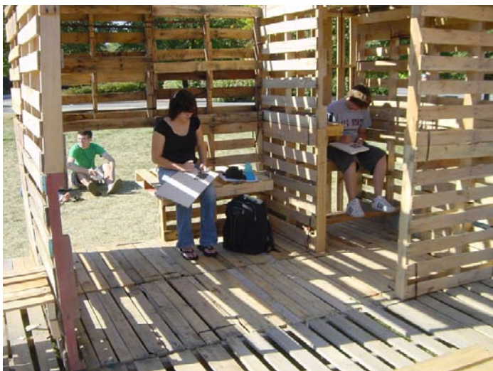
Students at Ball State University inhabit designs from wood pallets.

A third aspect of social contract ethics involves our relationship with nature. Some designers have begun to look at this question through the use of low-cost, sustainable materials and systems. Richard Kroeker and students at Dalhousie and Minnesota have worked with aboriginal and native communities to adopt indigenous approaches to construction using pliable wood materials in various woven and tied configurations drawn from what is immediately available on or near a site. He has also begun to look at materials in the modern waste stream, such as unused telephone books held in compression to form bearing walls. Another designer working in this area is Wes Janz, whose students at Ball State, along with Azin Valy and Suzan Wines of I-Beam Design, have developed ways to use the 1.9 million wood pallets destined for landfills in the U.S. for housing, drawing from the widespread use of pallets in squatter housing from around the world. These examples revise the ancient idea that we build with what we have at hand, and that we empower people to build for themselves.