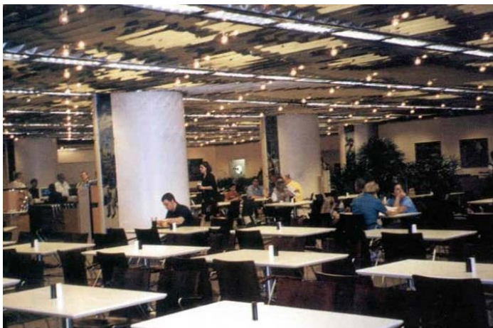
Cafeteria seating behavior: selection of preferred seating location.

In foodservice operations where guests can seat themselves, this preference for anchored seats is very apparent to any observer. Diners will select an empty anchored table first, but if no anchored table is available will choose an unanchored one that positions the diner well away from strangers.