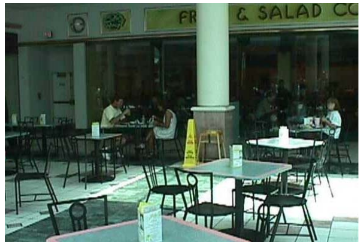
Food court seating behavior: “anchoring” of patrons to architectural features.

next to some kind of permanent architectural feature: a window, a wall, or even a low partition. This “anchoring” behavior is most likely related to psychological needs: we need personal space around us to feel comfortable. We try to define and defend our personal space by using elements of the environment as well as body position and eye contact to limit opportunities for encroachment. While research has shown that different cultural groups have different definitions of how much personal space is desirable, we have found that restaurant seating preferences are relatively consistent across multiple cultural groups.